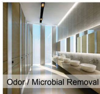
Odor / Microbial Removal