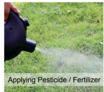
Applying Pesticide / Fertilizer